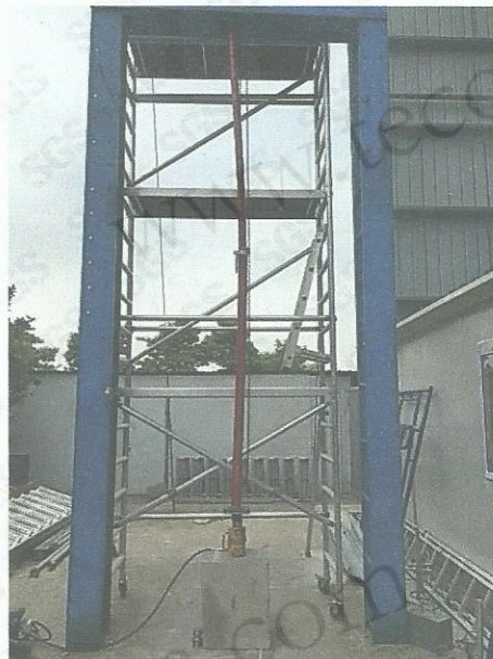
Sample 3 after test