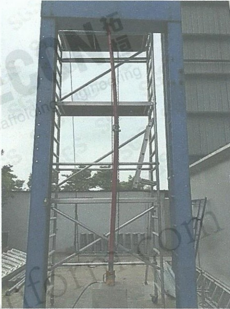
Sample 1 after test