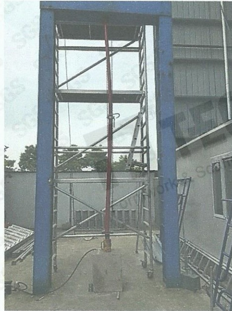
Sample 2 after test